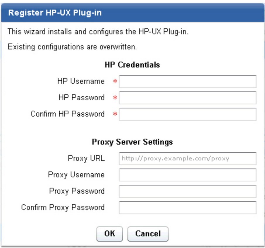
Figure 3. Register HP-UX download plug-in wizard

5. Enter the HP credentials that you use to log on to the HP Support site.